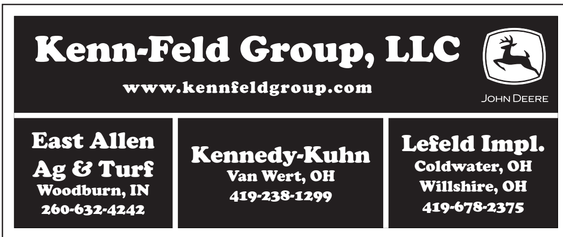
OMEDA 15 (2½" X 6")